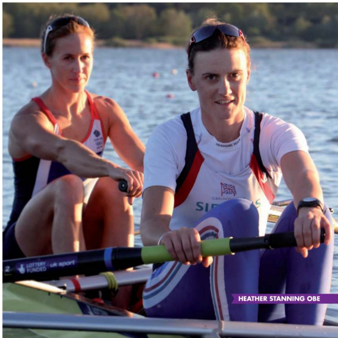
HEATHER STANNING OBE